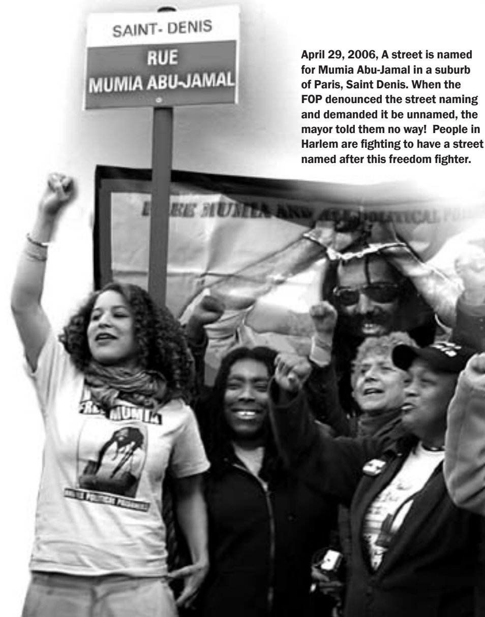
April 29, 2006, A street is named for Mumia Abu-Jamal in a suburb of Paris, Saint Denis. When the FOP denounced the street naming and demanded it be unnamed, the mayor told them no way! People in Harlem are fighting to have a street named after this freedom fighter.

The Federation of Police and Philadelphia's Don Imus—Michael Smerconish—want Mumia Abu-Jamal executed. Don't let them conduct another lynching.