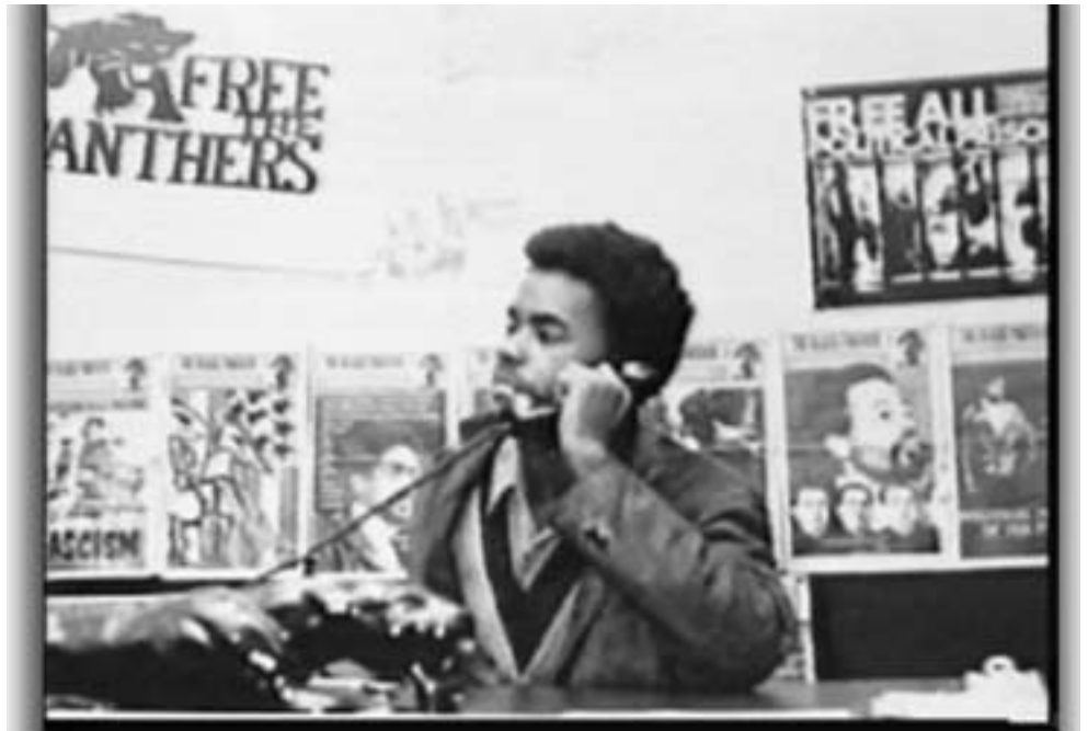
The teenage Mumia Abu-Jamal working in the Black Panther office